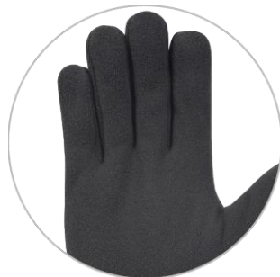
Close-fitting comfort fit