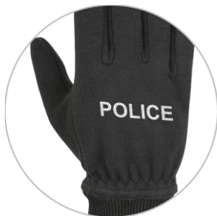
possibility of individual printing