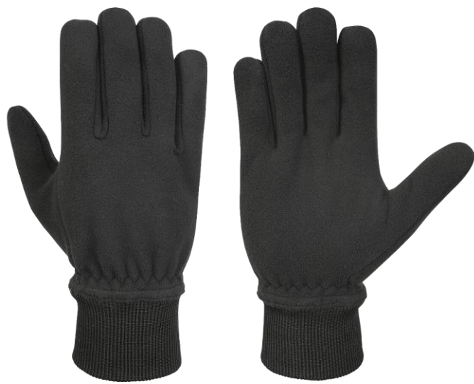
PARKER POLICE Short Black

Collection of special gloves for police and security services.